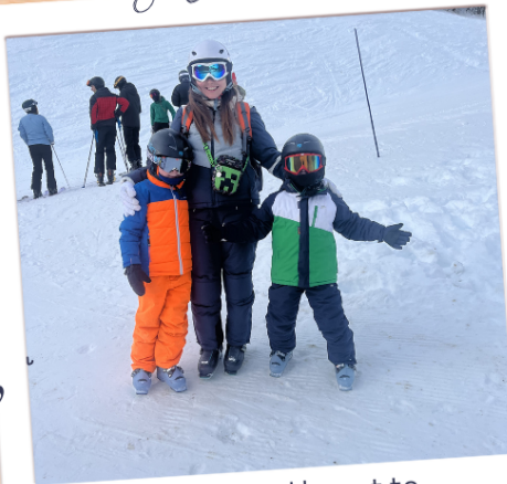
Last year, I learnt to ski and I loved it!