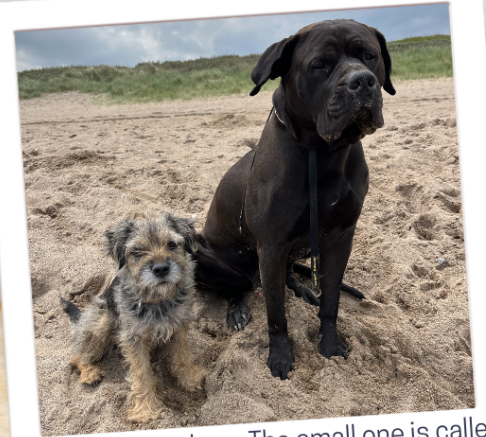
These are our dogs. The small one is called Nelson and the big one is called Zeus - they love the beach!