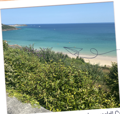
This is my favourite place in the world! Can you guess where it might be? (St Ives Bay).