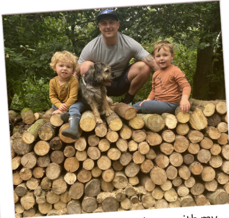
Adventuring outdoors with my family is my favourite thing to do!